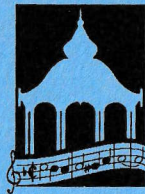
COMPTON HEIGHTS CONCERT BAND OF SAINT LOUIS

Eight consecutive Mondays from June 22 through August 10 at Henry Shaw Memorial Bandstand in historic Tower Grove Park